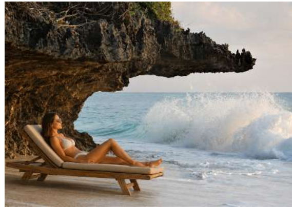
Beach Club & Recreation

A dedicated wellness destination designed to bring together relaxation, movement, and restorative care through spa treatments, fitness facilities, thermal experiences, and advanced wellness offerings.